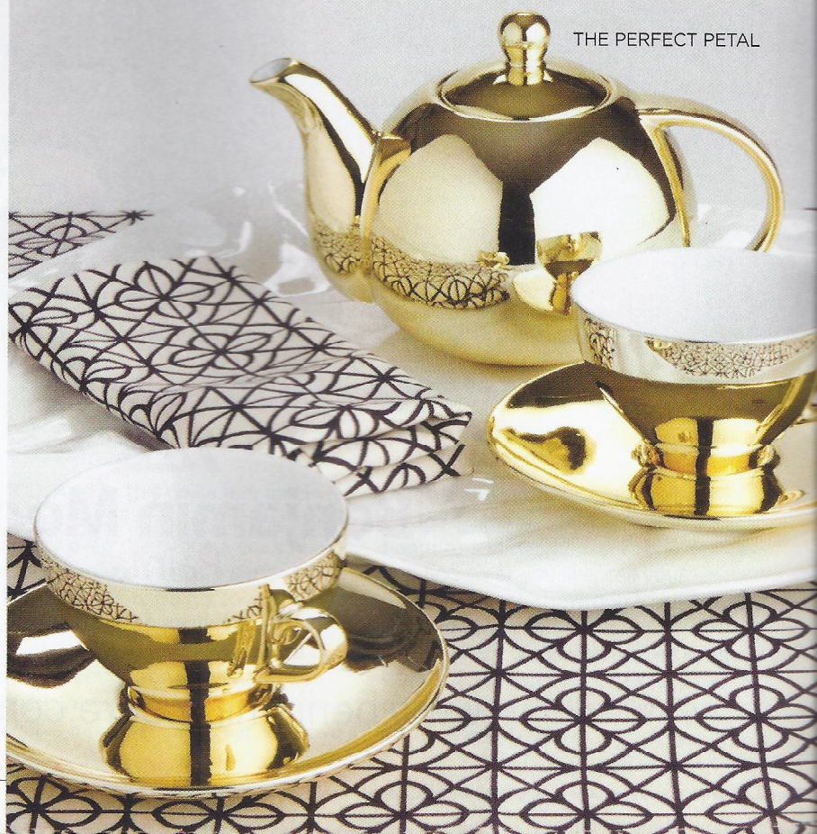
THE PERFECT PETAL

Skiing has been a mainstay of the Gorsuch family for generations, and its love for the alpine lifestyle done right is apparent in the company's classic line of clothing, ski gear and housewarming gifts—which we find particularly winsome. Gorsuch's array of pewter and china wares, picture frames, candles and other accessories evokes a traditional European charm while capturing the uniquely Coloradan spirit of fine living in the mountains. Trust us: Every home needs a little warming from Gorsuch. Gorsuchltd.com ▶